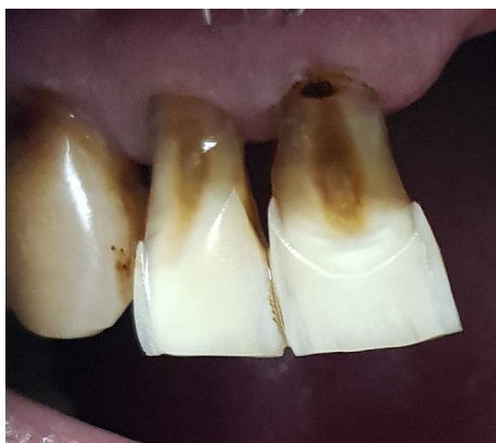
Fig. 1 Cervical abrasion lesions caused by the aggressive use of the chewing stick (Miswak).

These represent the clinical picture of the effect and give an indication of the aetiology.